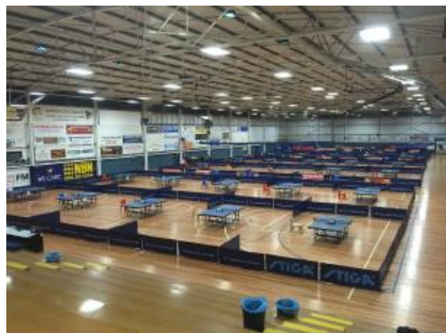
NPS 2015 Country Championships

The venue has 4 basketball courts, a 760 seat grandstand and a very good canteen. The lighting meets National requirements, 600 lumens.